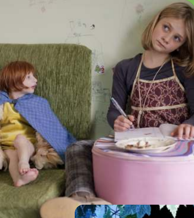
lep!, by Ellen Smit