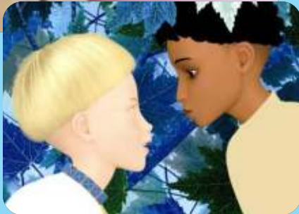
Azur and Asmar, by Michel Ocelot