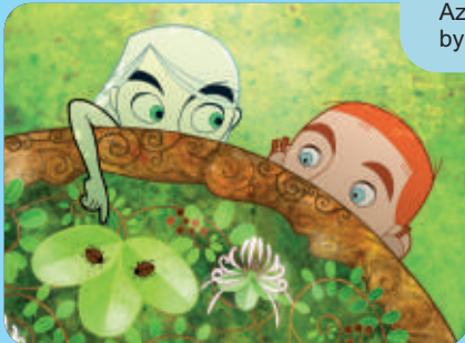
Brendan and the Secret of Kells, by Tomm Moore